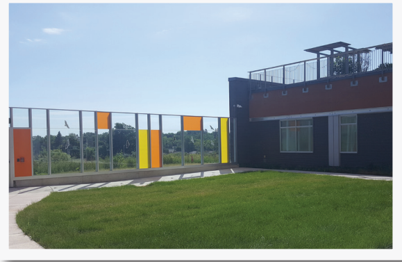
PHOTO: PRHC's new legacy donor-funded Child and Adolescent Psychiatric Unit (CAPU) courtyard will provide access to a safe, tranquil outdoor space.

For more information on how you can transform care at PRHC for future patients through your legacy gift, call (705) 743-2121 ext. 3957 or email lthomas@prhc.on.ca