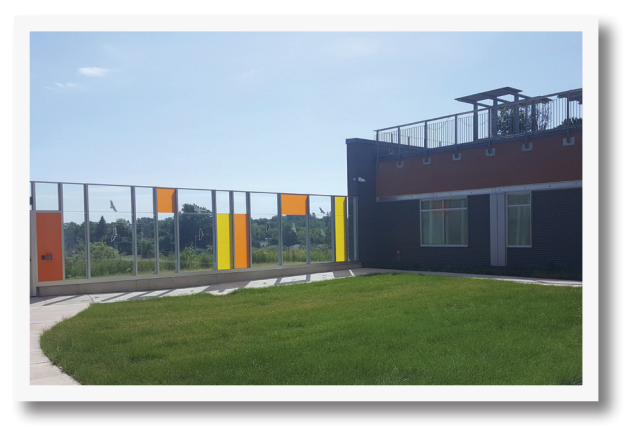
PHOTO: PRHC's new legacy donor-funded Child and Adolescent Psychiatric Unit (CAPU) courtyard will provide access to a safe, tranquil outdoor space.

The courtyard will provide a tranquil, safe, healing space for these young patients to