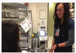
Donors support new vital signs monitors for Emergency Department