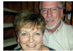
Grateful patient says thanks for support of cardiac care