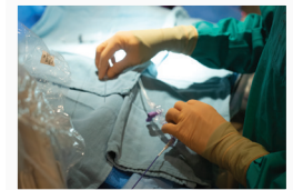
Spotlight on Cardiac Cath Lab reinvestment