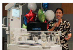
Highlights from the PRHC Foundation 40th anniversary