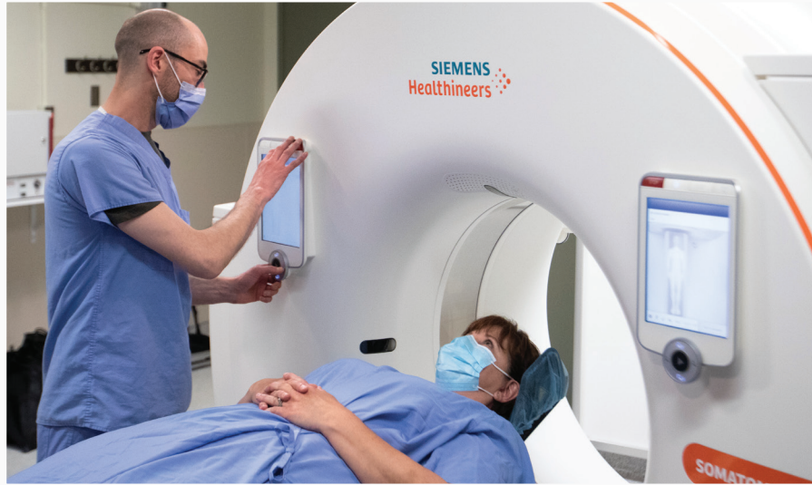
IMAGE: A medical radiation technologist demonstrates one of PRHC's new CT scanners funded by donors. The cutting-edge equipment supports more than 30,000 scans a year.

Cancer Clinic, to the Breast Assessment Centre, diagnostic imaging and laboratory testing, to Emergency Department, labour and delivery, and Neonatal ICU investments, and all areas in between, donors have touched every corner of the hospital.