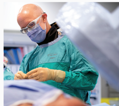
IMAGE: In the first month of full operation this fall, there were 324 visits for lifesaving and life-changing care at the newly upgraded, donor-funded Cardiac Cath Lab!

Thank you so much to our incredible community for stepping forward to