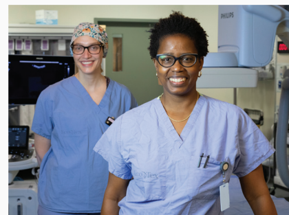
IMAGE: Your support will help expand PRHC's interventional radiology program so experts can perform more innovative procedures.

This level of advanced and complex healthcare is available in the Peterborough region as a direct result of our generous donors. But PRHC's interventional radiology suites are now 14 years old and are too small to fit new, advanced technology and