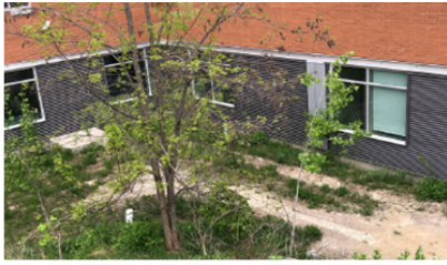
IMAGE: Your donations can help PRHC turn this space into a modern Psychiatric Intensive Care Unit courtyard to support the healing of some of its sickest patients.