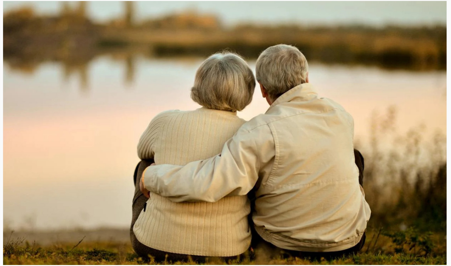
IMAGE: Planning a charitable gift to the PRHC Foundation in your will is an opportunity to leave a legacy of innovation and care, while still ensuring that your family is taken care of.